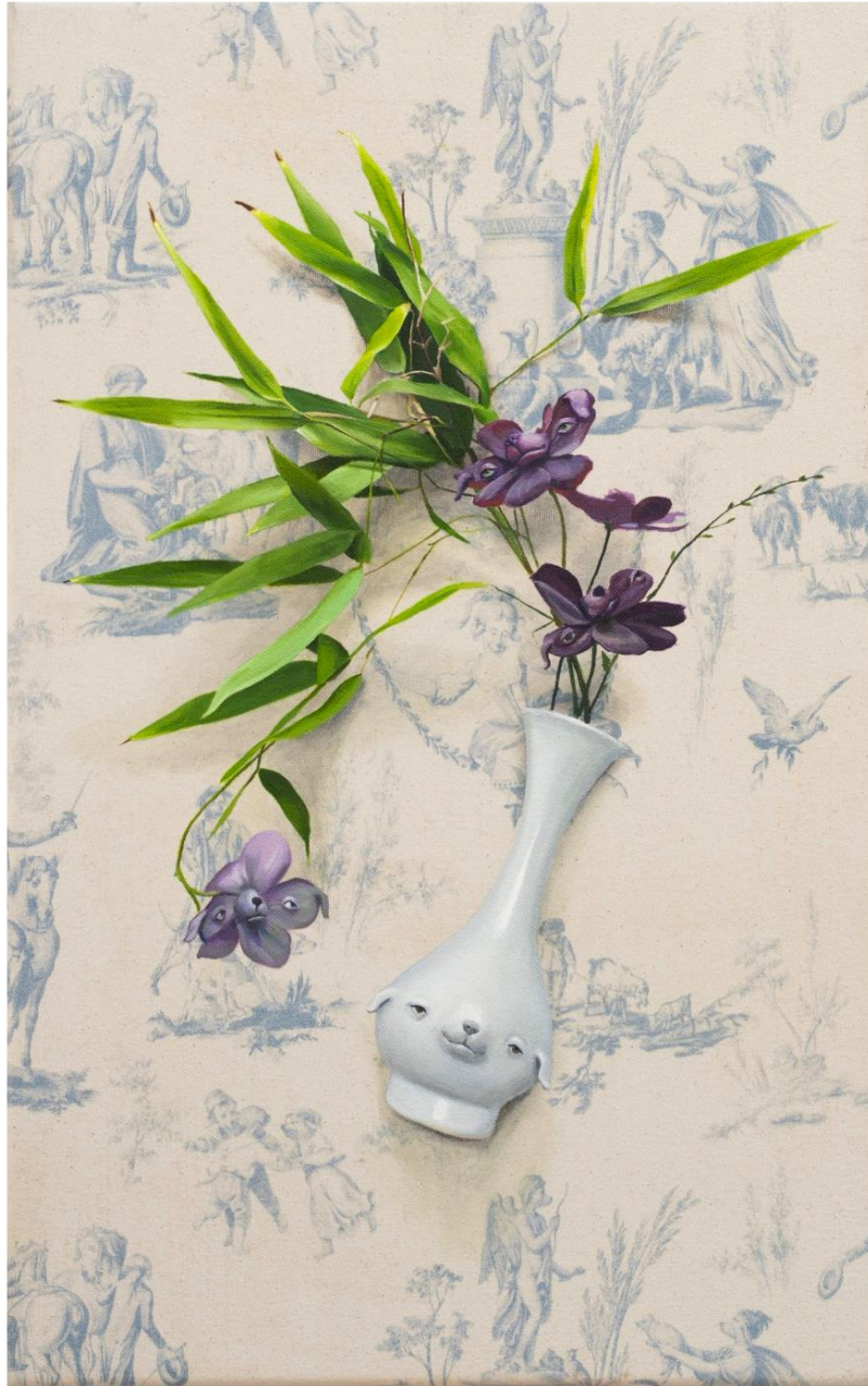
"Untitled (Paris 2)" (2025), oil on canvas, 20 x 15 inches

France is referenced in Morrison's paintings by backgrounds of toile, or toile de jousy , a fabric design popular in the 18th century that features pastoral scenes, while Maine is represented by patchwork quilts he co-designed with his mother, who actually stitched them before they were incorporated into the works. "By bringing the objects and backgrounds into my dog world, I've rewritten my external material world through this lens, creating a new and more uniquely personal vision of these places," he says.