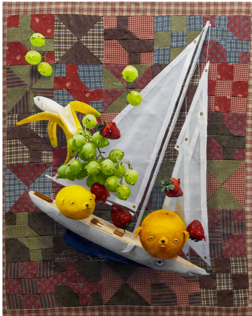
“Untitled (Maine 2)” (2026), oil on quilted fabric on panel, 20 x 16 inches

In this series, the artist grapples with what belonging means, from revisiting his childhood home in Maine to thinking about his past decade in New York City to spending two months in Paris, where, “despite being married to a Frenchman, having many French friends, and having spent considerable time in the city, I had never felt at home,” he says. “The ornate beauty of the architecture and the sense I have of everything being solidly ‘in its place’ makes it hard to feel inspired there for me.” So, he set out to explore that sense of disjointedness and creative conflict.