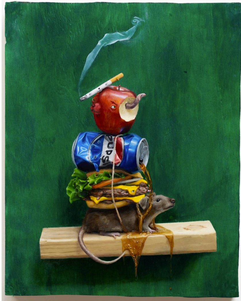
"Untitled (NYC)" (2026), oil on panel, 20 x 16 inches