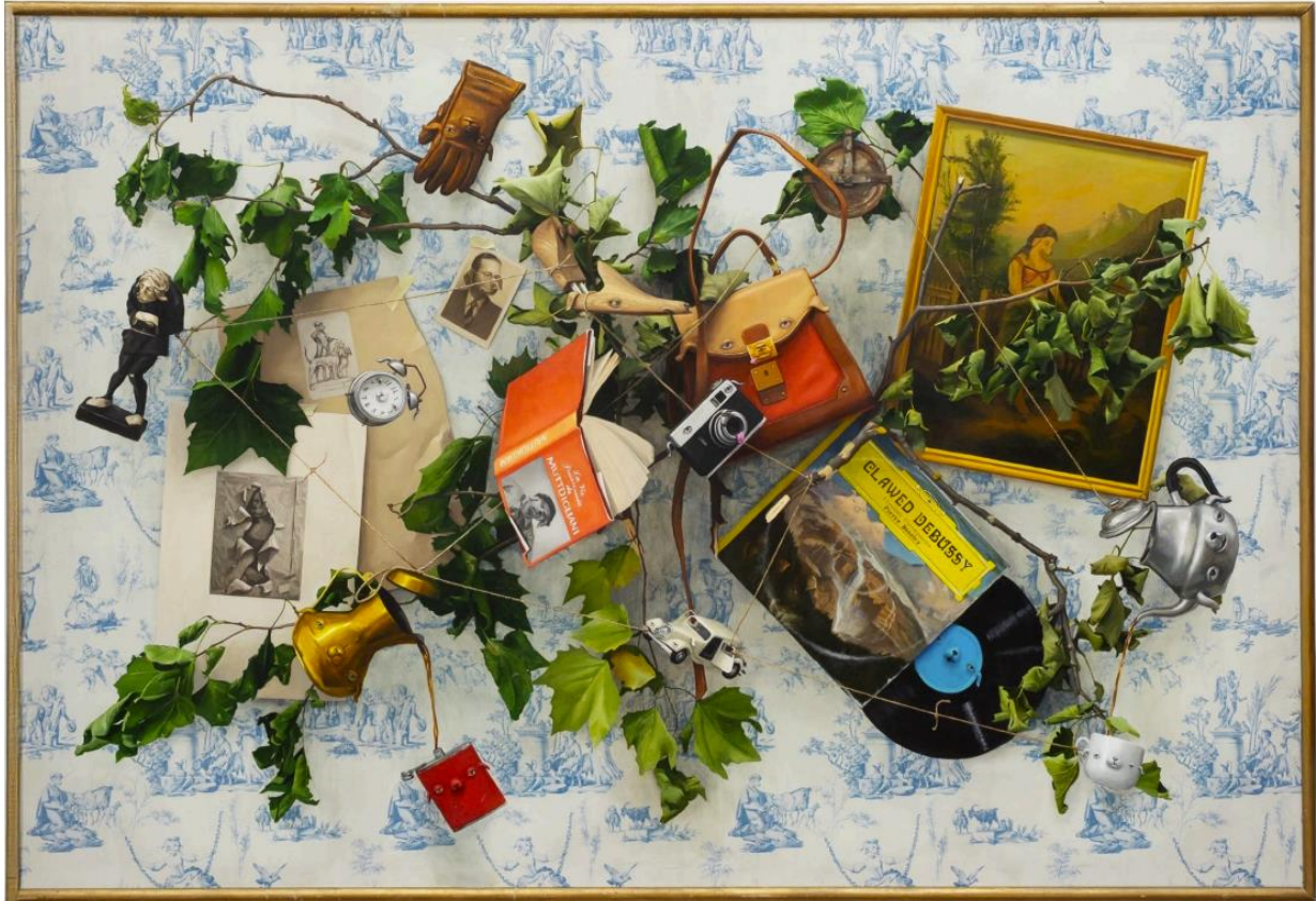
"147 Rue Léon-Maurice Nordmann" (2025), oil on canvas, 51 x 79 inches.