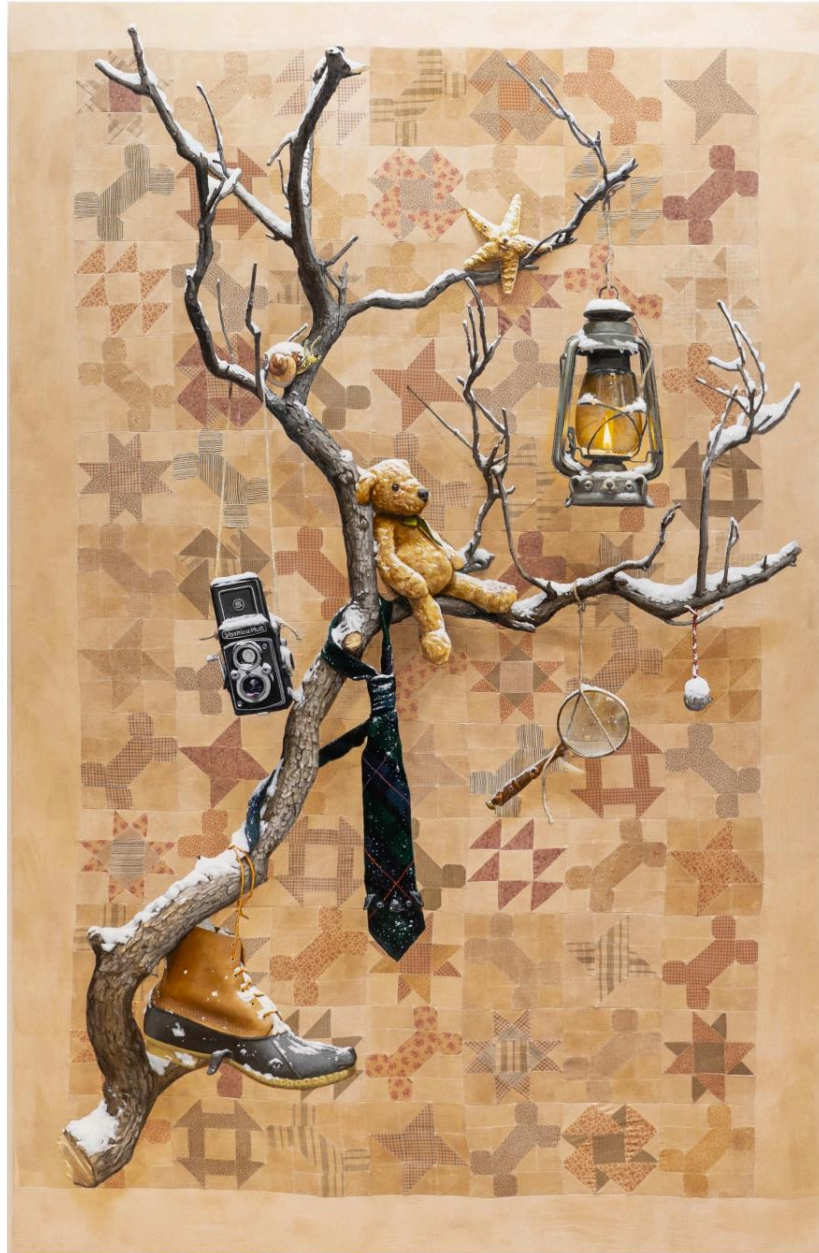
"111 Limerock Street" (2025), oil on quilted fabric on panel, 79 x 51 inches

Morrison's practice has lately revolved around trompe l'œil compositions of everyday objects and tableaux in which dogs' features appear unexpectedly. A snout stands in for the flap of a handbag or juts out from the side of a Pepsi can. His current solo exhibition, Dog Show #5: Field Recordings at SLAG&RX , centers on a series of objects referencing places he worked on the pieces—Paris, New York City, and Maine—that also play important roles in his life.