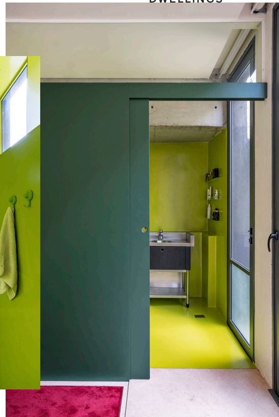
A lime-green bathroom on the lower level (above) has fixtures from Brazilian manufacturer Docol.

I met Tito on a hot day. We were seated around the long, rectangular dining table that anchors the heart of the house, where the open kitchen meets the living room under the roof's downward slant. Sliding glass doors bookend the space. They open on the east end to a small entry patio with a barbecue pit and to the west provide direct sight lines to the terrace and garden below, as well as to a massive araucaria tree in the distance that towers above the densely vegetated skyline. "When we saw this tree outside, we decided to make it really stand out and emphasize this outlook on the city," says Tito. "This house is where we disconnect from the world."