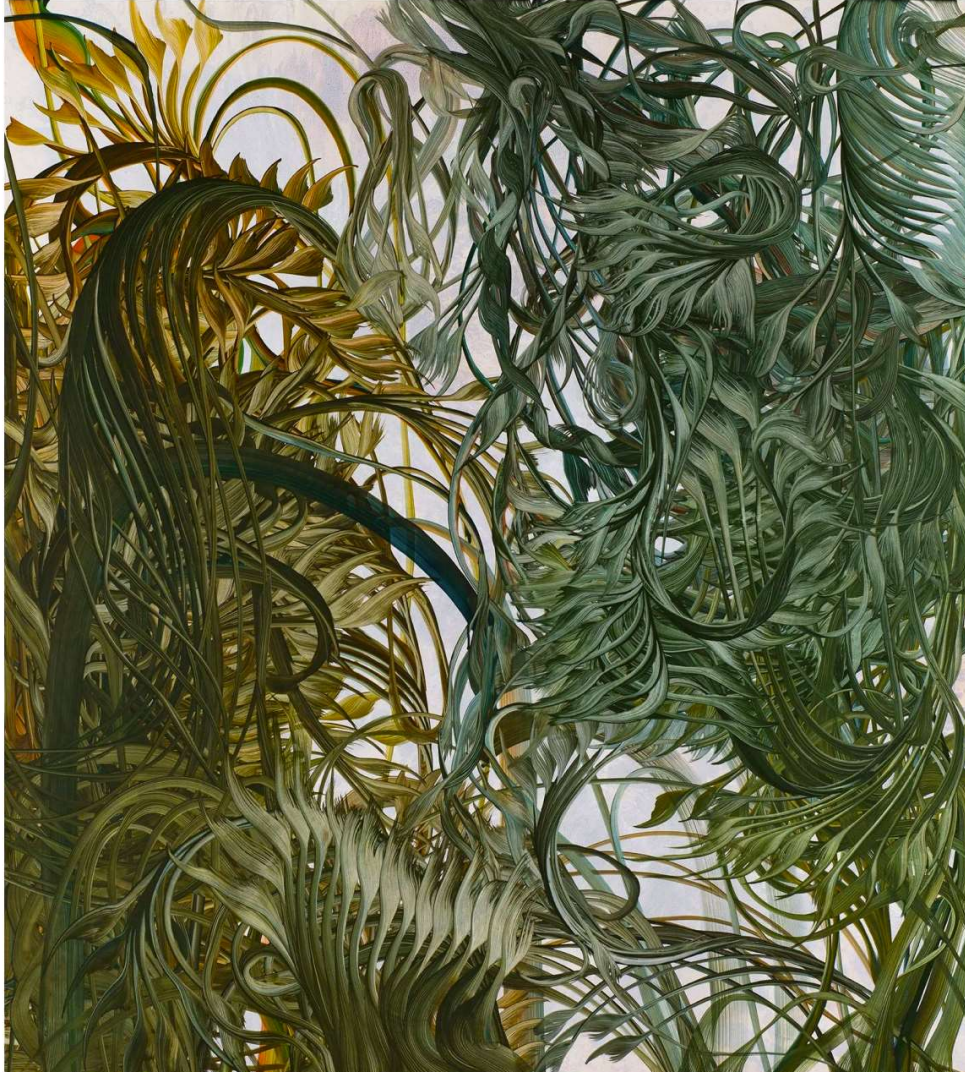
Edyta Hul, Untitled , 2024. Oil and enamel on canvas, 71 × 63 in. (180 × 160 cm).

In each work, Hul balances the foreground and background in a non-hierarchical way so that the eye cannot fully rest on any one area. This stylistic device poses a subtle challenge to the opportunistic gaze that usually falls upon our natural systems, as there is no single item for us to extract. One untitled piece particularly demonstrates her compositional prowess by the diagonal separation of the sinuous life forms into different shades of understated greens. This palette is more grounded than some of the extraordinary color choices elsewhere in the show, but the predominately soft pink background, with its subtle variations and textures, warms the entire composition. An unexpected deep blue arc presses into the middle of the picture plane as if to remind viewers that we are observing a plausible realm that harbors incongruous elements just slightly outside of reality.