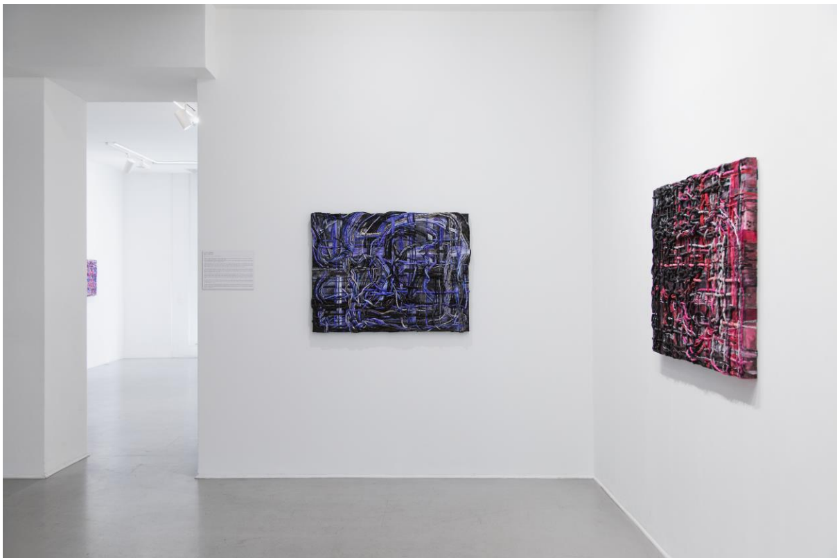
View of the Mood Machines exhibition by Chellis Baird

On the white walls, black and red, black and blue... the colors stand out and attract the eye. Red, as sanguine by hatred as by love, occupies a special place in what seems to be the ideal realm of order and chaos... a metaphorical representation of the world. Mood Machines (or mood machines) takes us back to our own antagonisms and questions our experiences of the perceived world... our states of consciousness. Are we, ultimately, a machine like any other or, conversely, could a machine feel the same thing as us... the feeling of evil as well as good. In these taut, crossed, intertwined textile ramifications, woven like the vines of an impenetrable jungle... circulates a form of tireless energy. Veins and arteries, nervous system, neural or artificial network, electrical or computer circuit, roots or rhizomes... countless cables that circulate life and information at every moment... quantum entanglements.