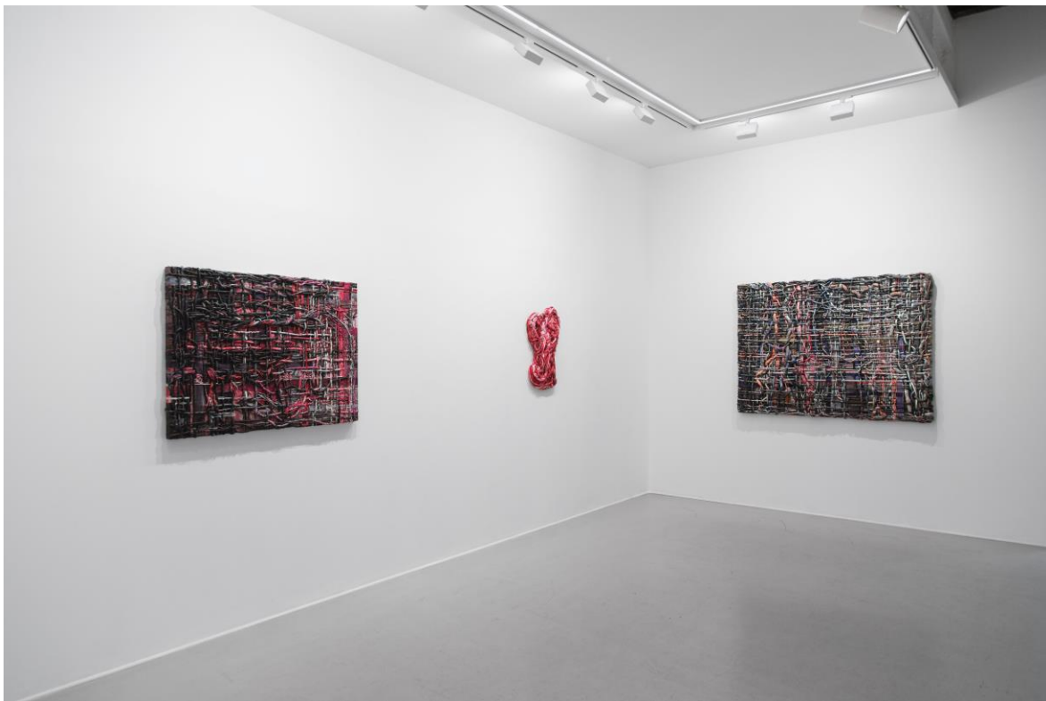
View of the Mood Machines exhibition by Chellis Baird

From fashion to canvas... dressing the body as the medium. From her career as a stylist, Chellis Baird has retained a sense of material and textures... but also that of volume and couture. Her works have a sculptural presence... an inhabited relief that makes shadow and light resonate... breathe colors. And they have their importance! Everything could be monochrome but nothing really is... like an oversized tweed that changes appearance depending on the point of view from which we look at it... like a change of mood. The exterior appearance echoes the interior convolutions. They have a dark side and a light side. Don't stay static! Move! Get closer and move away... go from left to right then back... like dance steps. Perception and emotion are enriched in the subtle movement around these living works... a questioning.