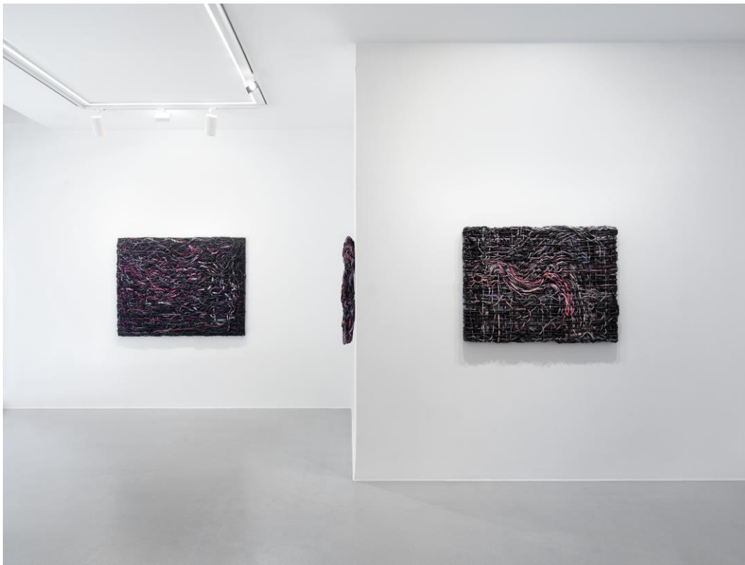
View of the exhibition "Mood Machines" by Chellis Baird

What things would look like from the inside... a tangled web... a complex network... a portrait of our sublime emotional entanglements. Ultimately, a well-kept secret... even from ourselves! “Mood Machines” is the first solo exhibition by American artist Chellis Baird at RX&Slag in Paris. On view until August 2, it is the result of her artistic residency at the Cité internationale des Arts in Paris... an Ariadne's thread that leads us to explore the labyrinth of our feelings... intimately linked to the work.