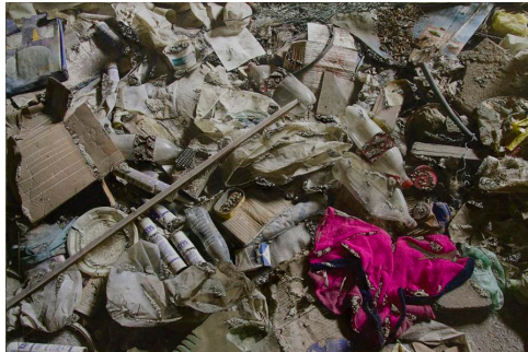
Naomi Safran-Hon - WS: Pink Sweater (with other trash) , 2016, acrylic, gouache, lace, cement and archival ink jet print on canvas, 28 x 42 in.

Curated by Chief Curator and Museum Director Alice Gray Stites.