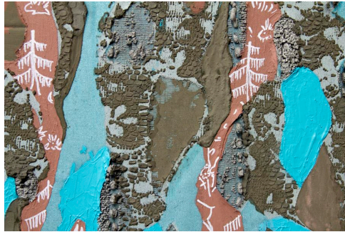
Naomi Safran-Hon , Detail: WS: Light Switch and Coat Rack in Six Parts , 2016, acrylic, gouache, archival ink jet print, lace and cement on fabric and canvas, 68 x 42 in.

Scarpa, and the architecture collaborative SO-IL."